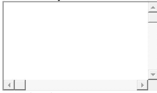
500 words maximum

How would you define success for this project? *