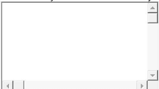
500 words maximum

How would you define success for yourself? *