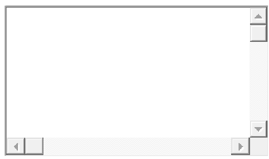
500 words maximum

Again, noting that this accelerator aims to elevate underrepresented* voices, why is this film important to make? Why do you have to be the one to make it?