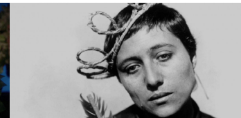
THE PASSION OF JOAN OF ARC (WITH LIVE SCORE)

For 2020, we'll continue to feature the best in film, including a few that we already know are coming our way.