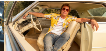
ONCE UPON A TIME IN HOLLYWOOD (35MM)