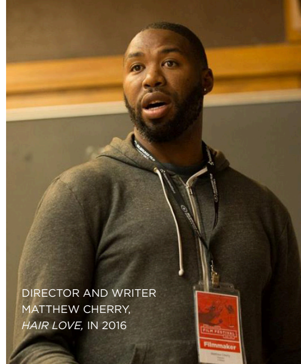
DIRECTOR AND WRITER MATTHEW CHERRY, HAIR LOVE , IN 2016

750: STUDENTS IMPACTED BY REEL TALKS, WHICH BRING FILMMAKERS INTO THE CLASSROOM