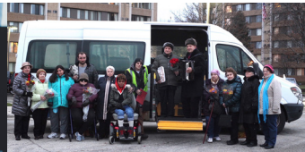
GIVE ME LIBERTY