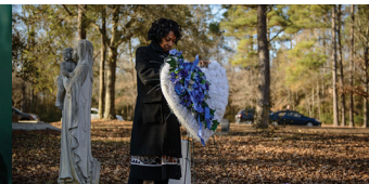
ALWAYS IN SEASON