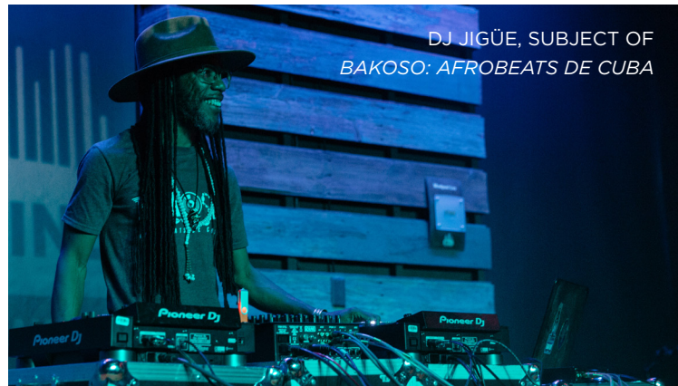
DJ JIGÜE, SUBJECT OF BAKOSO: AFROBEATS DE CUBA

12: FEATURE FILMS IN THE CINE SIN FRONTERAS PROGRAM AT MFF 2019